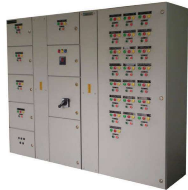
HT/LT electrical work