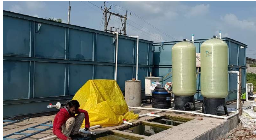
Package Pre-fab STP plant based on MBBR technology (ZLD)